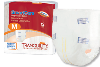
Tranquility® SmartCore® Tape-tab Disposable Brief Maximum Protection