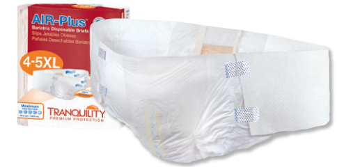
Tranquility® AIR-Plus™ Bariatric Tape-tab Disposable Brief Maximum Protection