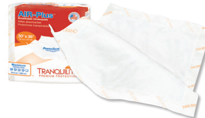
Tranquility® AIR-Plus™ Breathable Underpad Maximum Protection