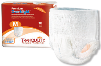
Tranquility® Premium OverNight™ Pull-on Disposable Underwear Maximum Protection