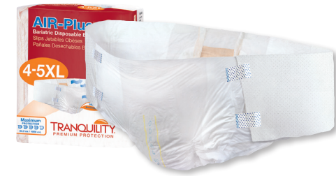
Tranquility AIR-Plus™ Bariatric Tape-tab Disposable Brief Maximum Protection