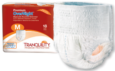
Tranquility Premium OverNight™ Pull-on Disposable Underwear Maximum Protection