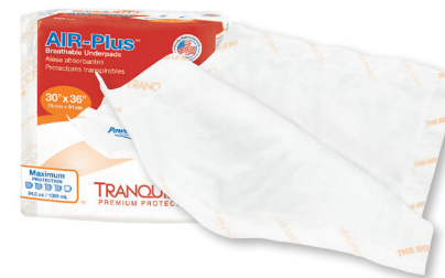
Tranquility AIR-Plus™ Breathable Underpad Maximum Protection