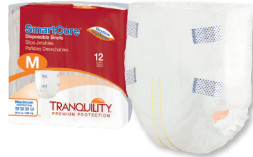
Tranquility SmartCore® Tape-tab Disposable Brief Maximum Protection